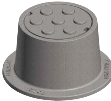
Illustrating bottom flange

Floor and monument boxes Floor boxes are used in concrete floors to provide access to openings and valve controls. They can also be used as forms in concrete floors wherever a round opening is desired. Sizes listed in order of clear openings